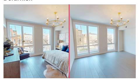
Matterport's new defurnish tool uses AI to remove furniture and other objects from virtual property listings.